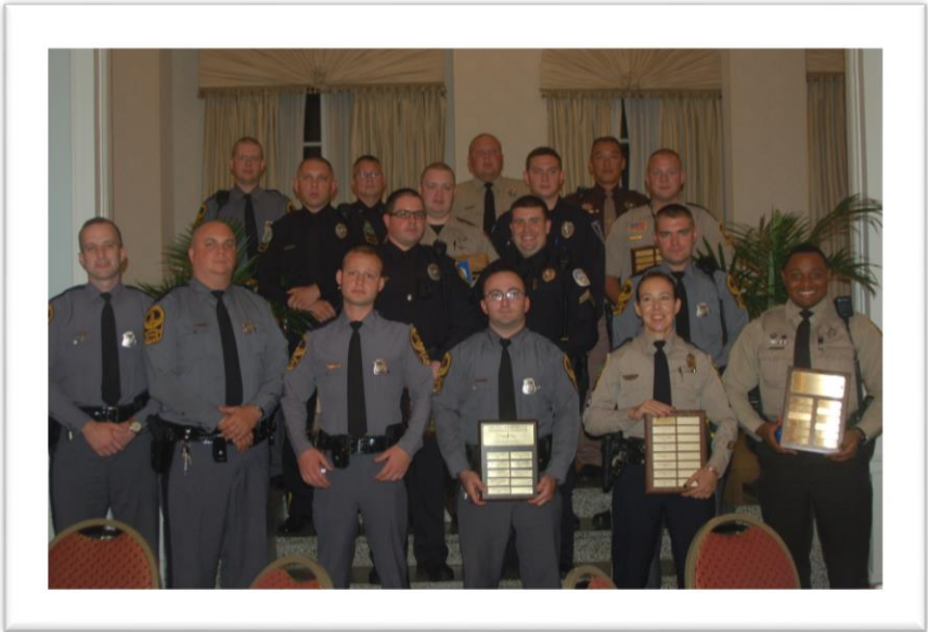
Group Picture of officers attending the MADD awards dinner on September 20, 2018.